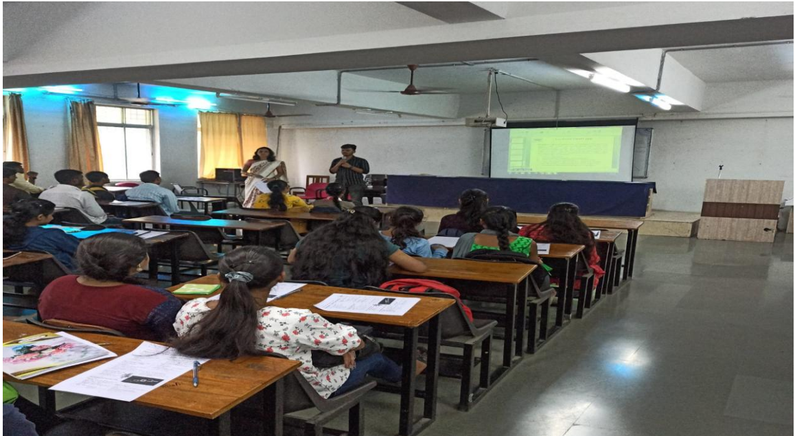
Entrepreneurial Skill Development, Training, and Placement