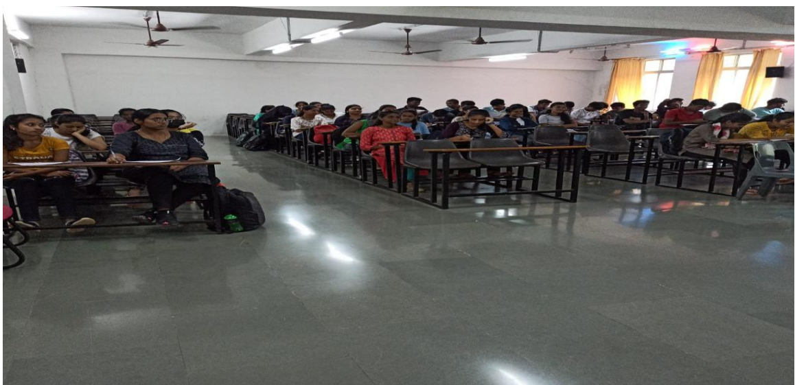
Entrepreneurial Skill Development, Training, and Placement